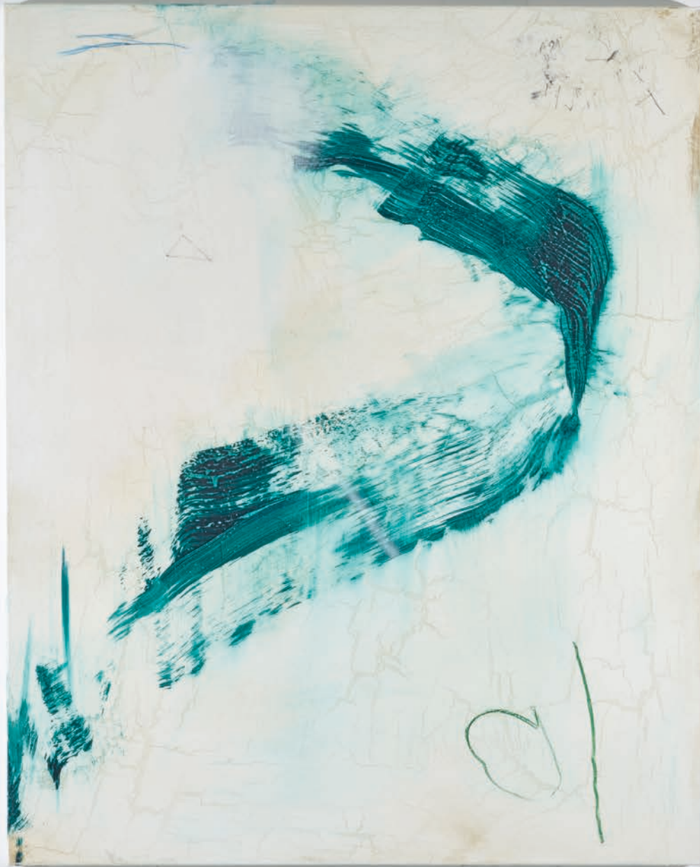
The moments past mixed media on canvas 150cm x 120cm