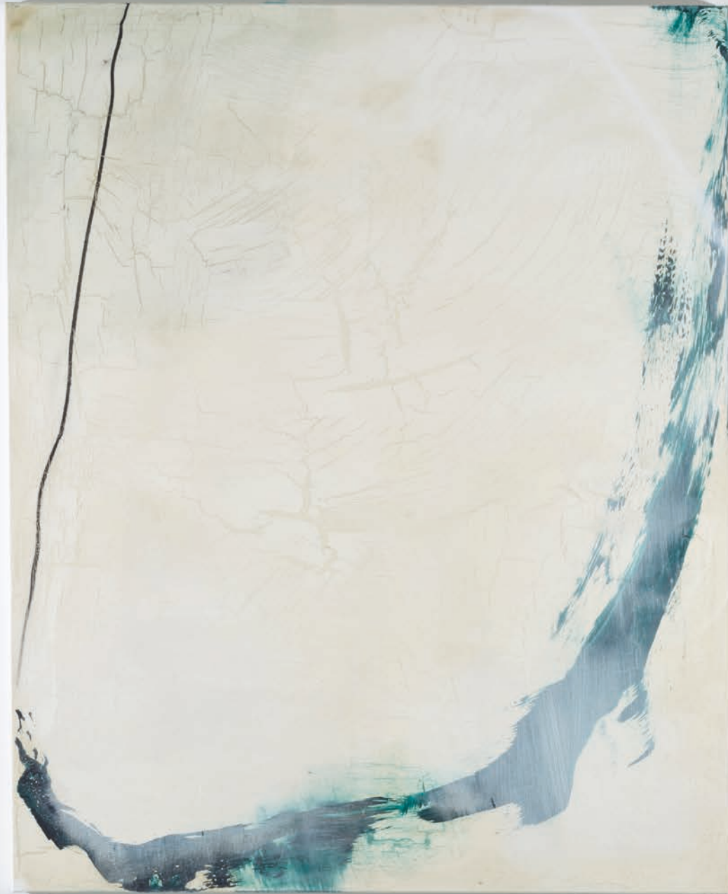
From all sides mixed media on canvas 150cm x 120cm