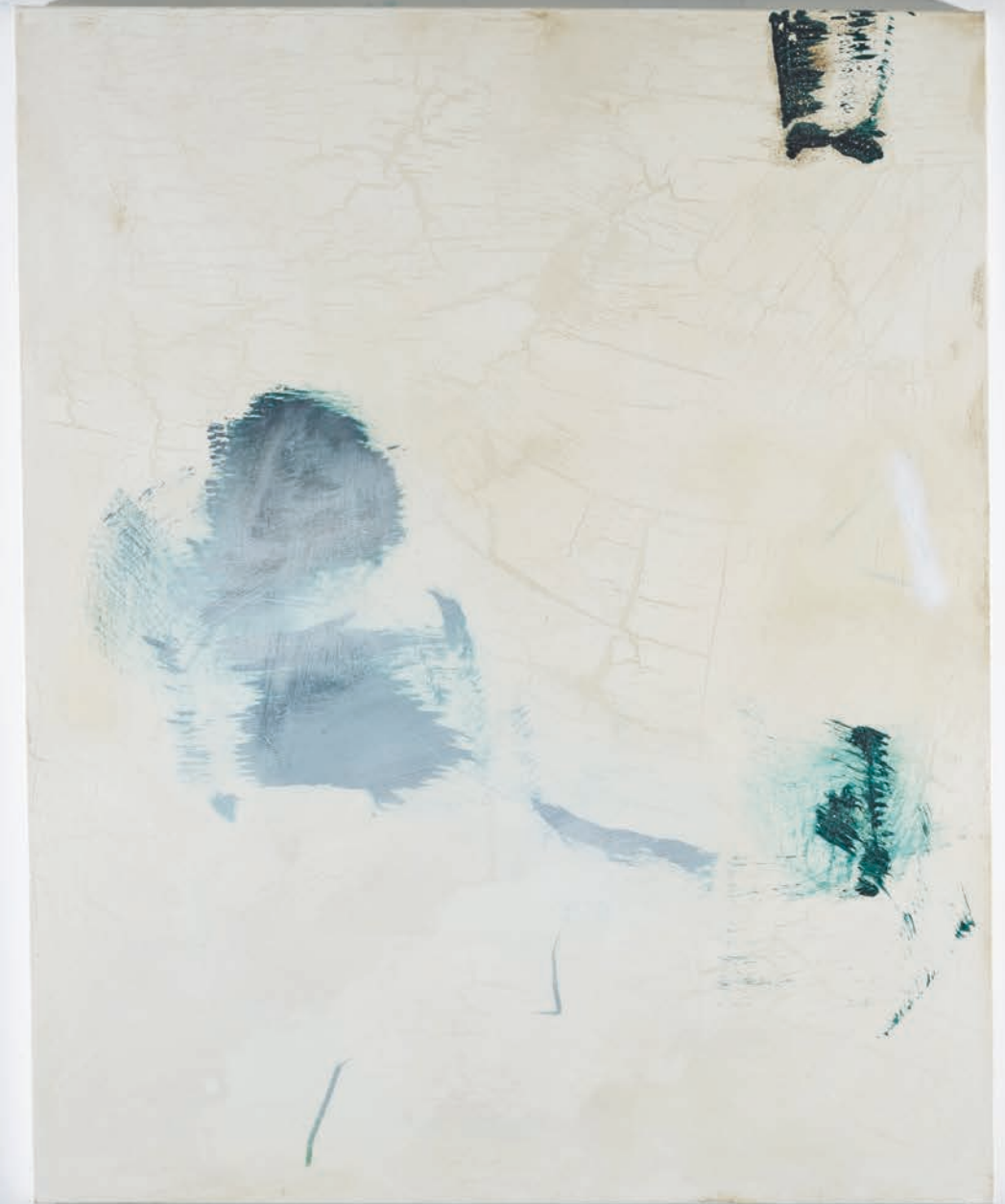
Space wide open mixed media on canvas 150cm x 120cm