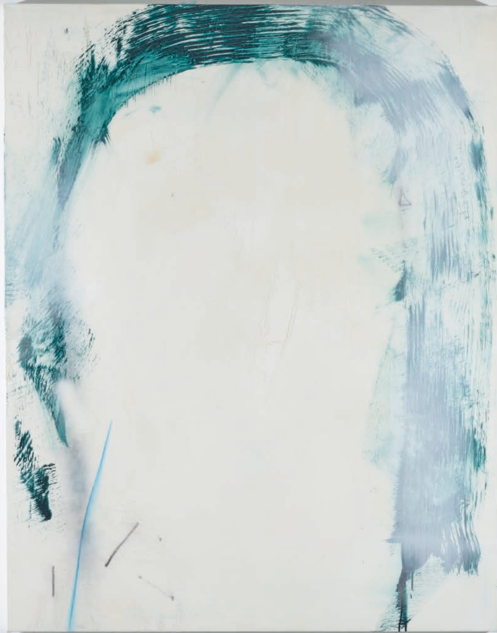
Blue strikes through mixed media on canvas 150cm x 120cm