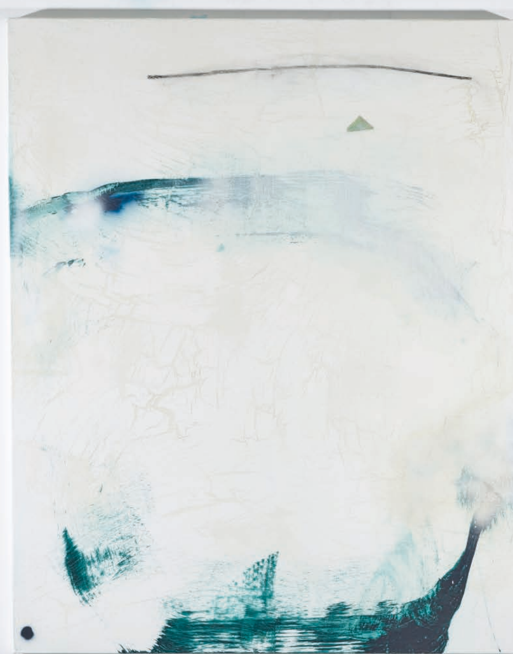
Overhead and overheard mixed media on canvas 150cm x 120cm