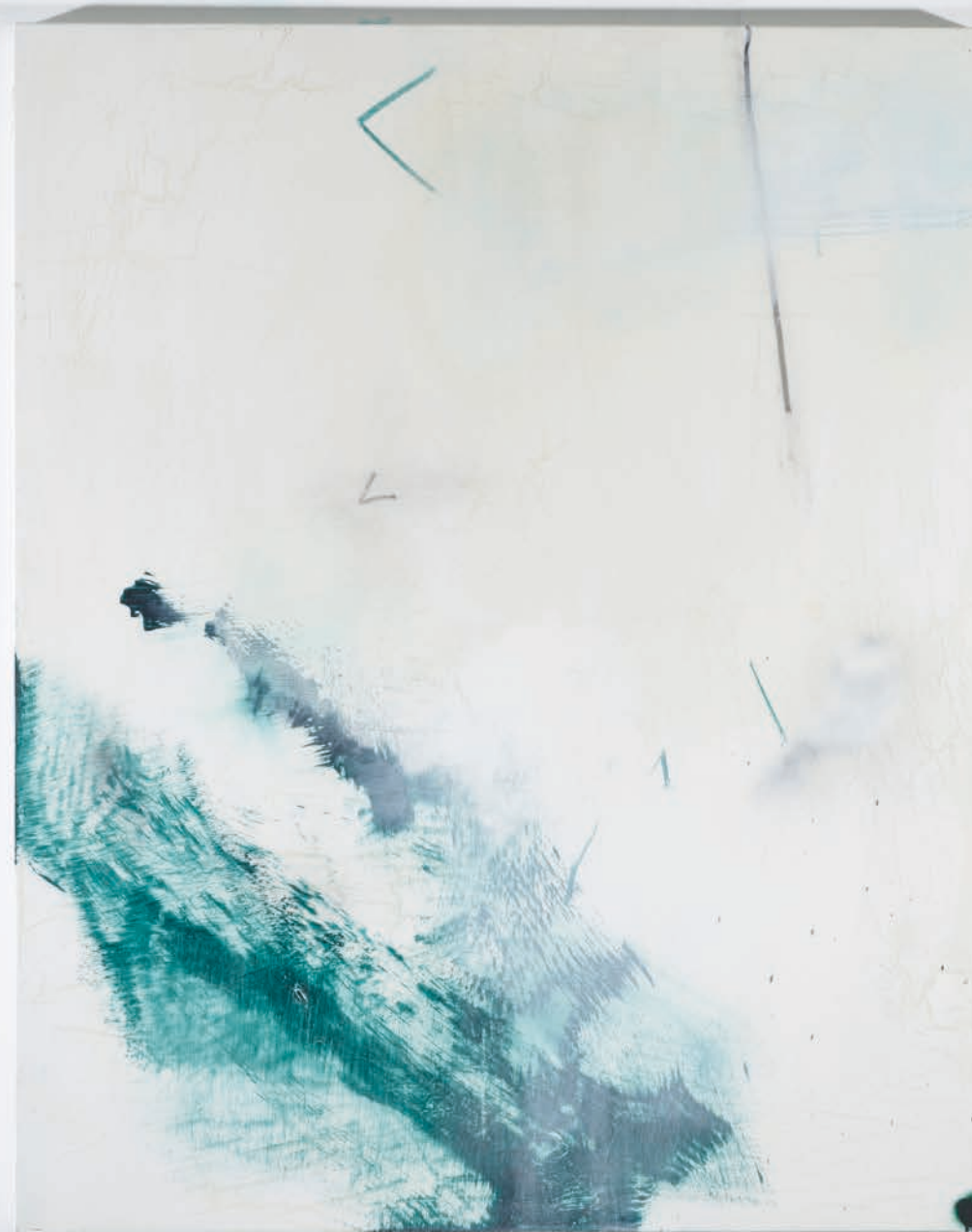
Where arrows fly mixed media on canvas 150cm x 120cm