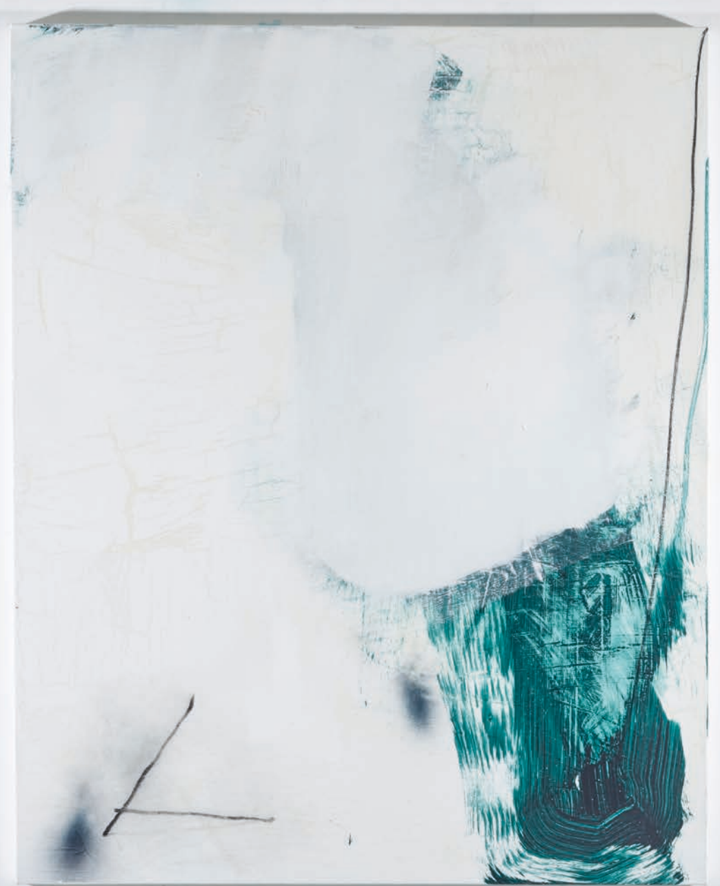
Air to breathe mixed media on canvas 150cm x 120cm