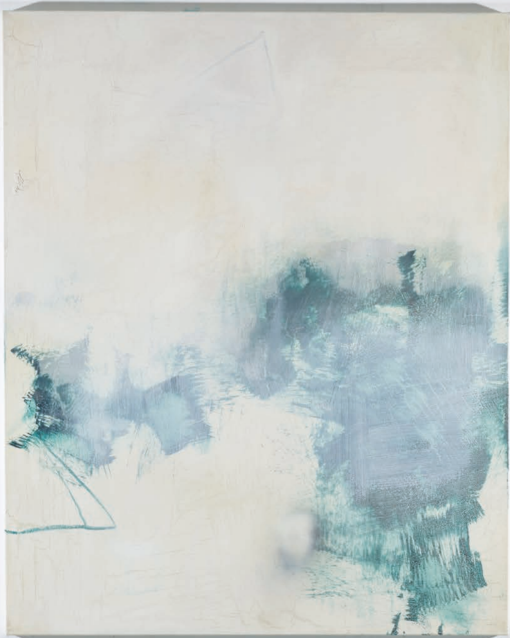
Two becomes one mixed media on canvas 150cm x 120cm