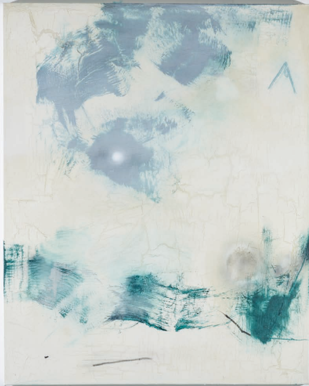
Steered me home mixed media on canvas 150cm x 120cm