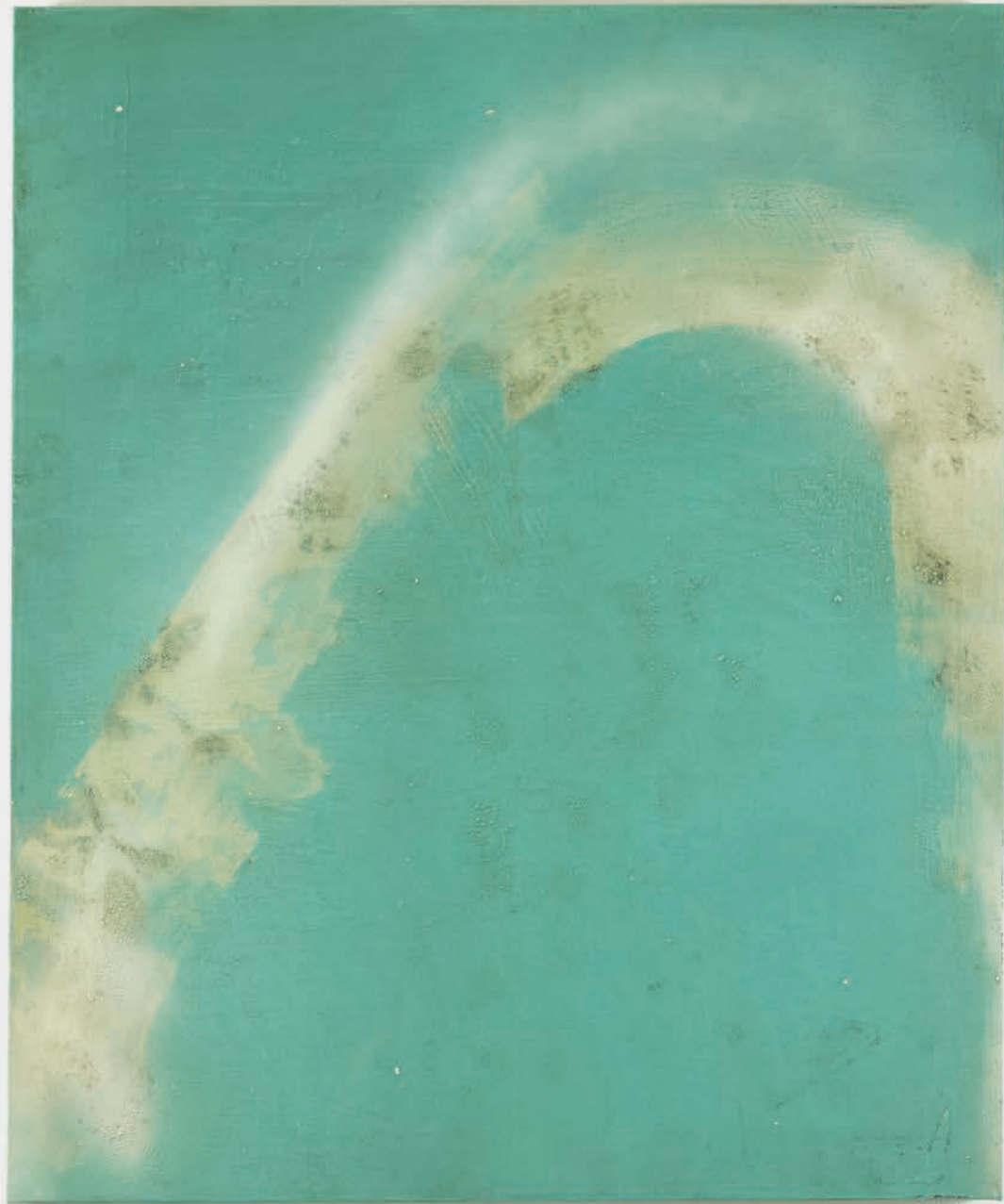
ABOUT YESTERDAY I