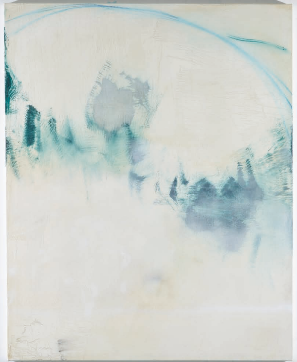
As the crow flies mixed media on canvas 150cm x 120cm