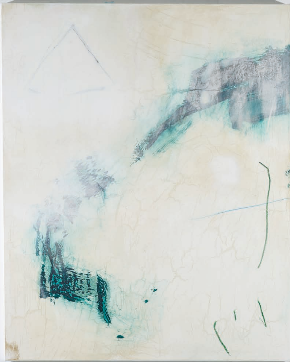
Seems you found me mixed media on canvas 150cm x 120cm