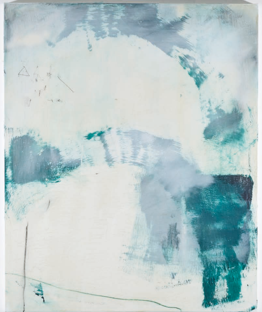
Twice the echo mixed media on canvas 150cm x 120cm