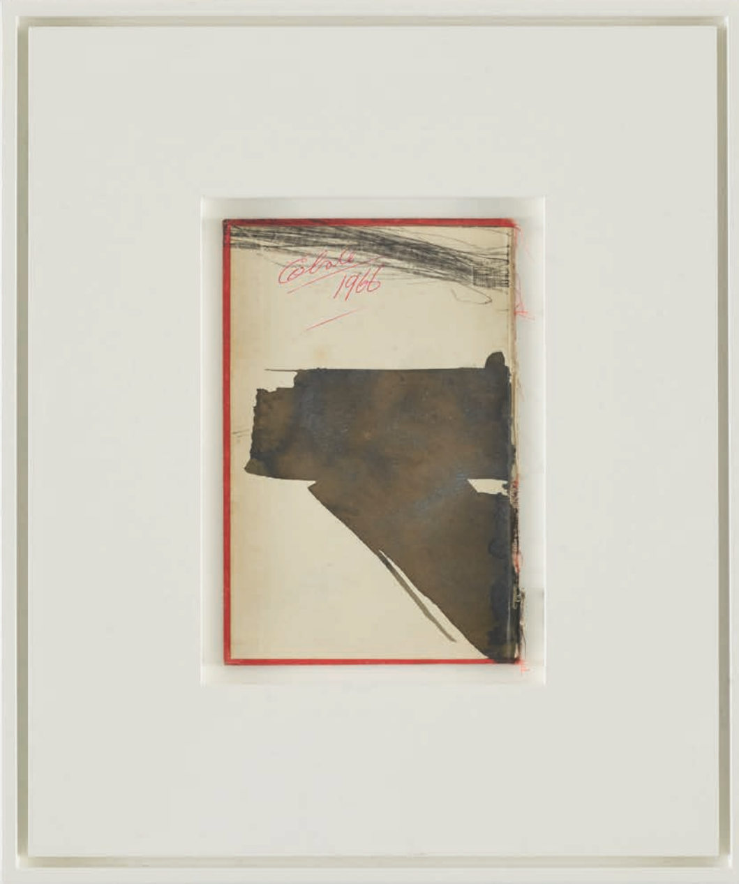
BOOK COVER (1966)