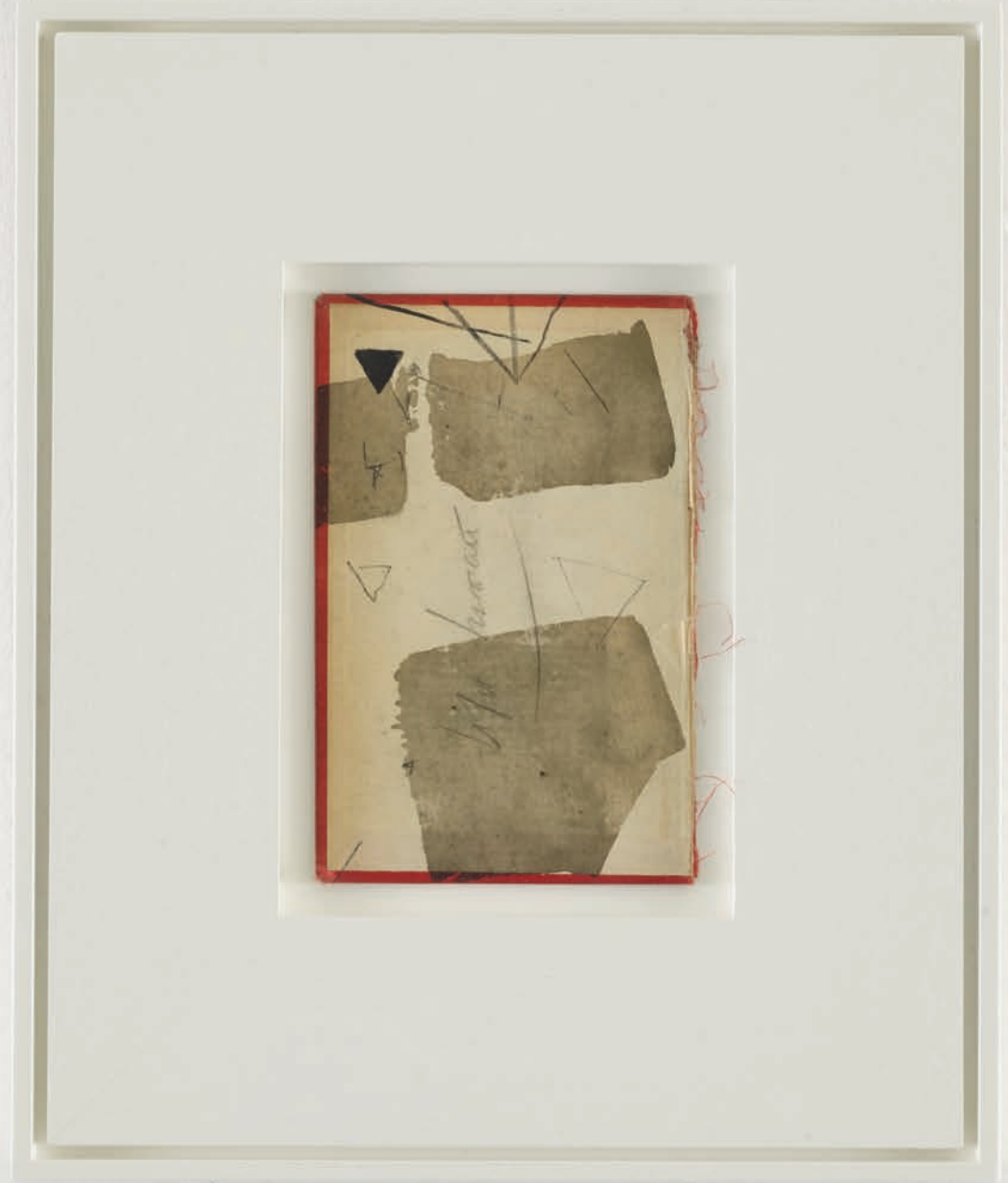
BOOK COVER (Scattered)