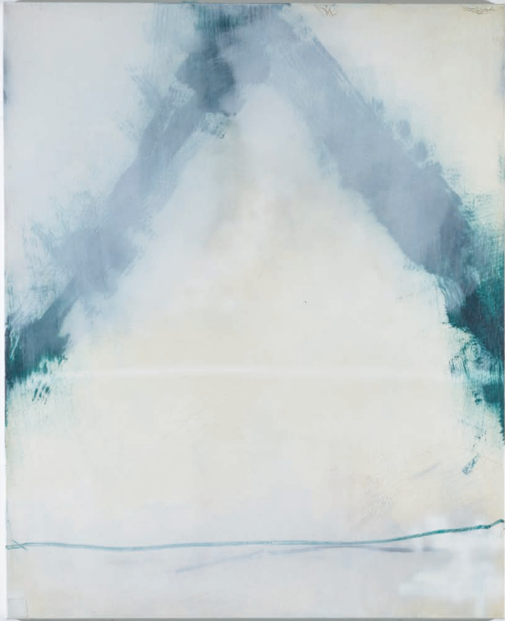
Go where you don't know mixed media on canvas 150cm x 120cm