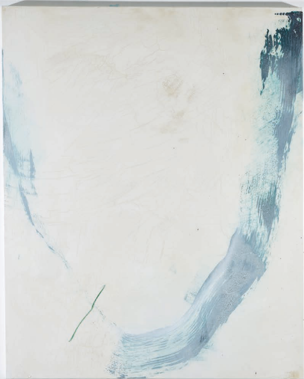
Falling far behind mixed media on canvas 150cm x 120cm