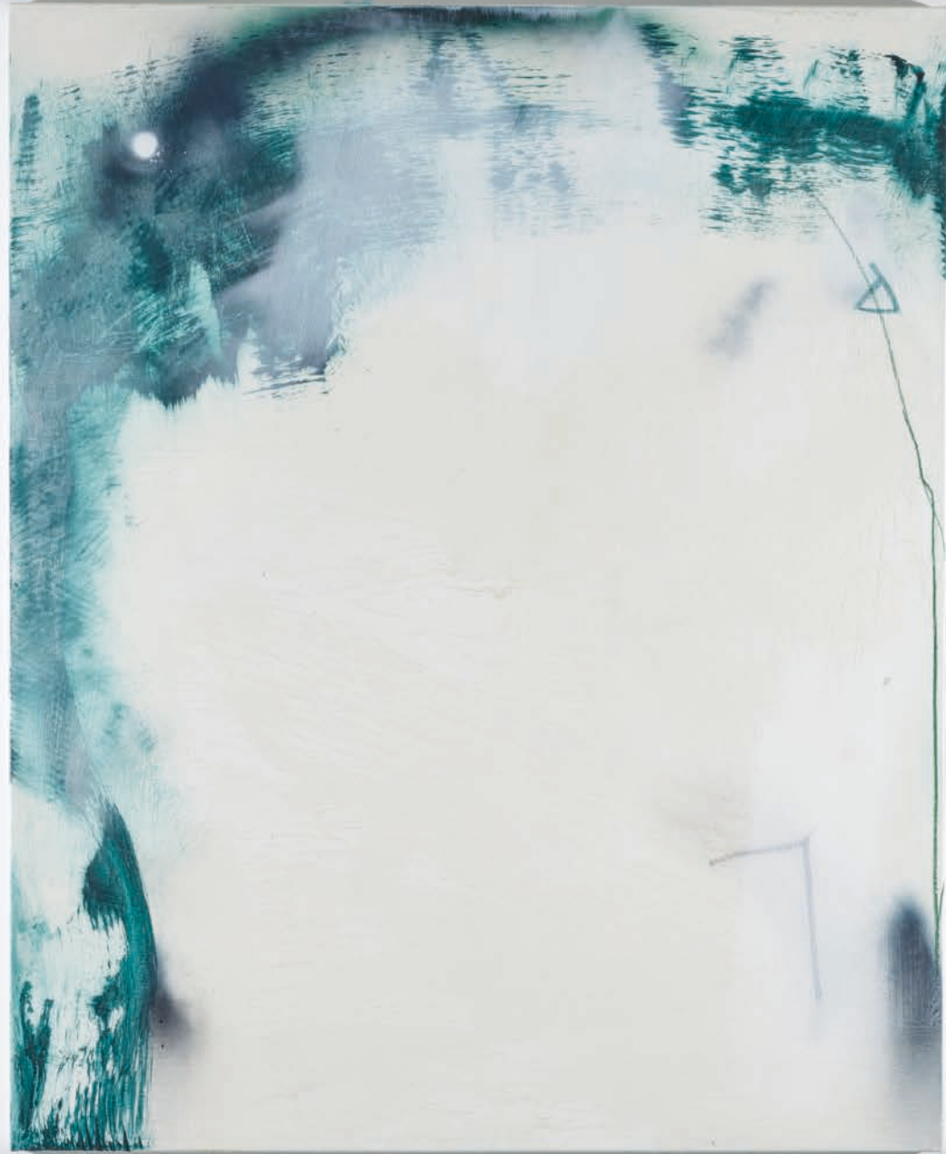
In the distance mixed media on canvas 150cm x 120cm