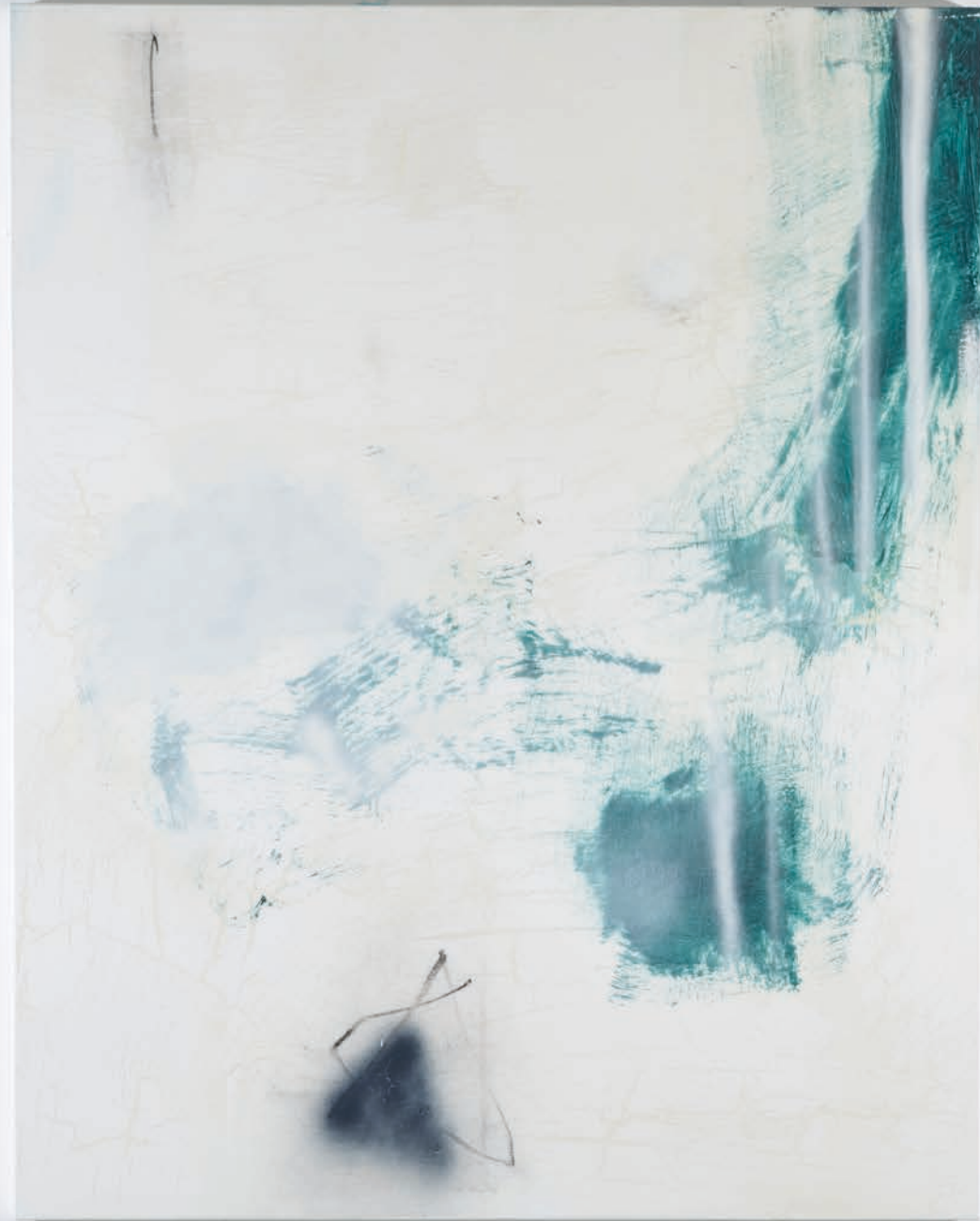
Just let them go mixed media on canvas 150cm x 120cm