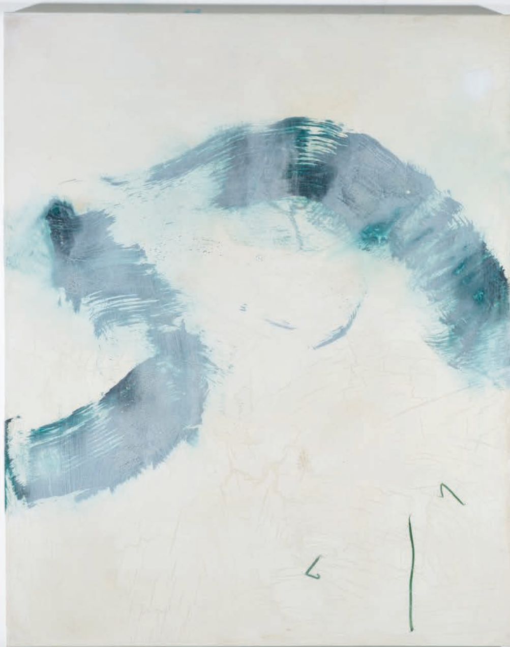
Inside these arms mixed media on canvas 150cm x 120cm