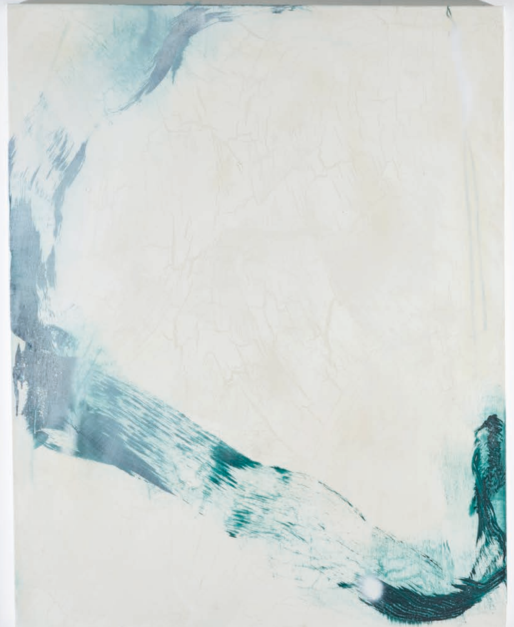
Smaller and smaller mixed media on canvas 150cm x 120cm