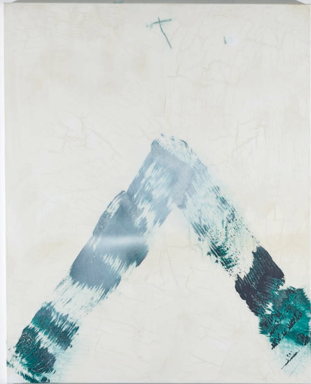
A leap of faith mixed media on canvas 150cm x 120cm