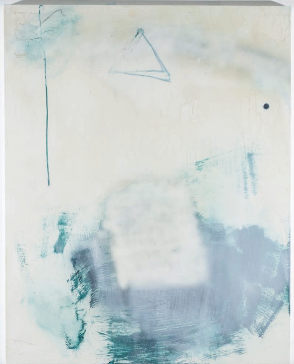
All that was mixed media on canvas 150cm x 120cm