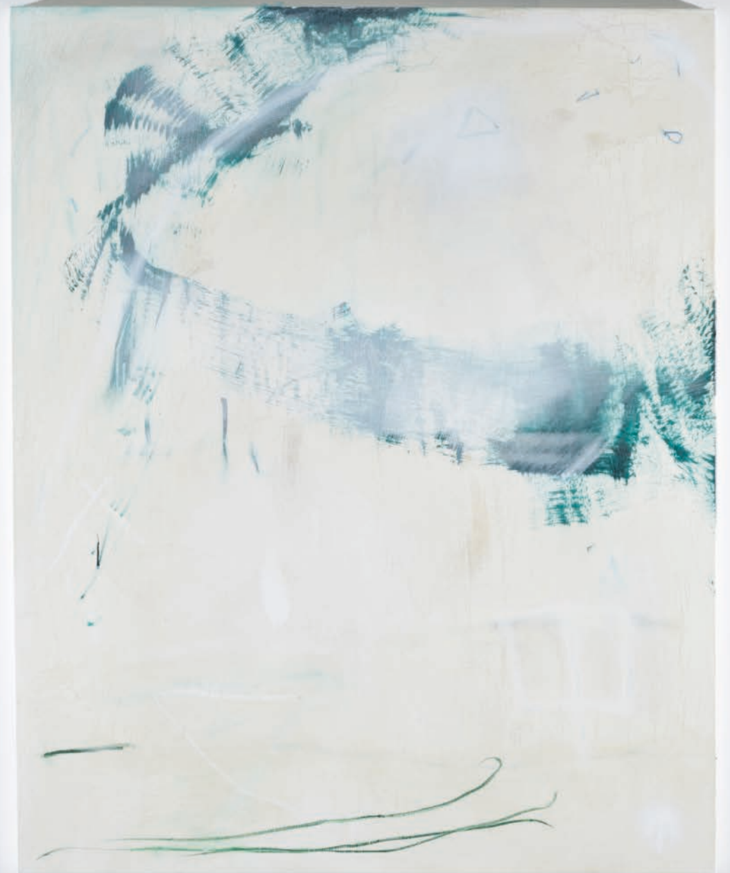
Three times without mixed media on canvas 150cm x 120cm