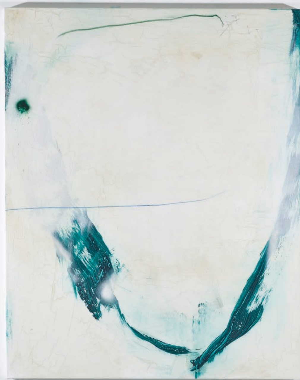
Nothing to be done mixed media on canvas 150cm x 120cm