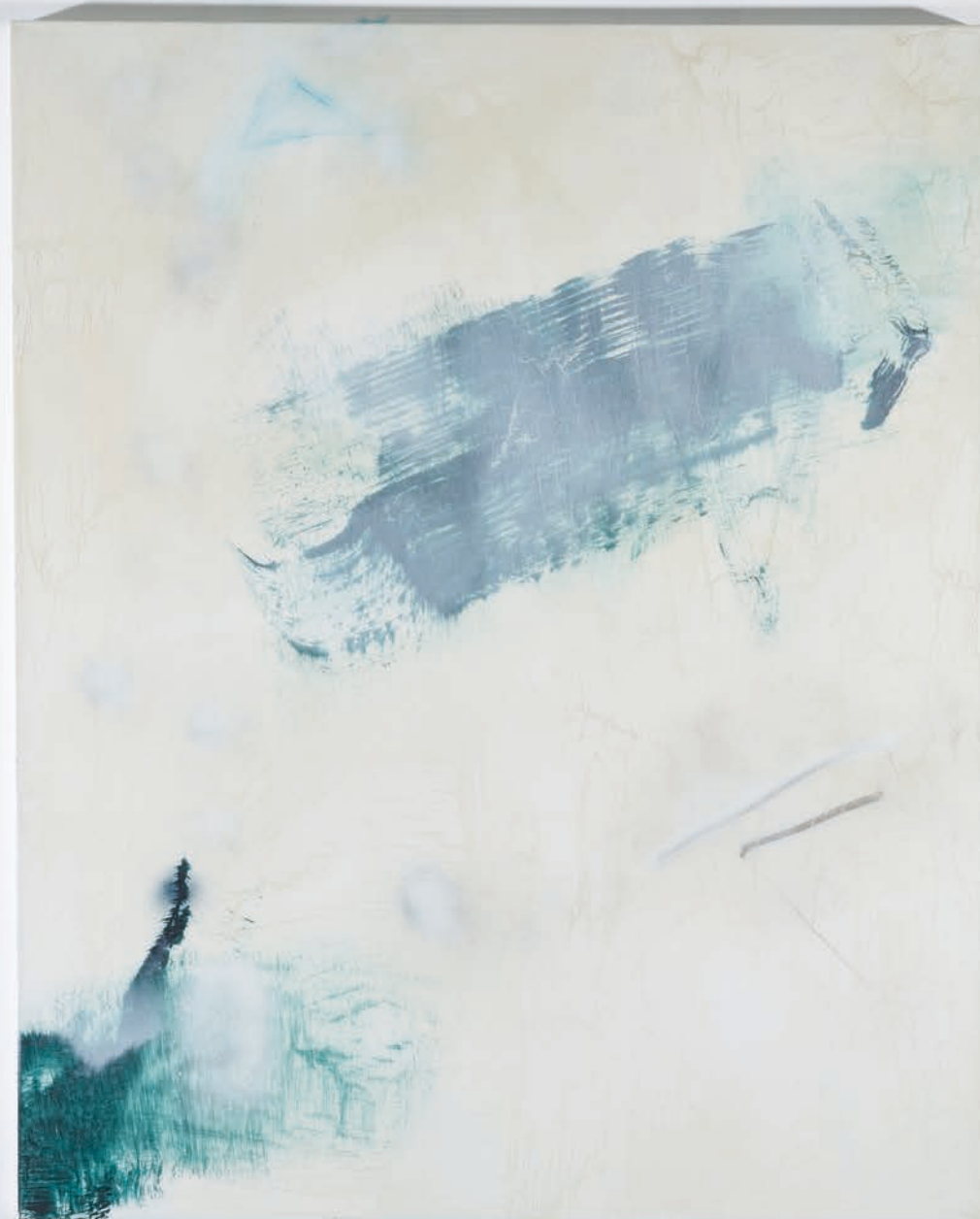
Go find another mixed media on canvas 150cm x 120cm