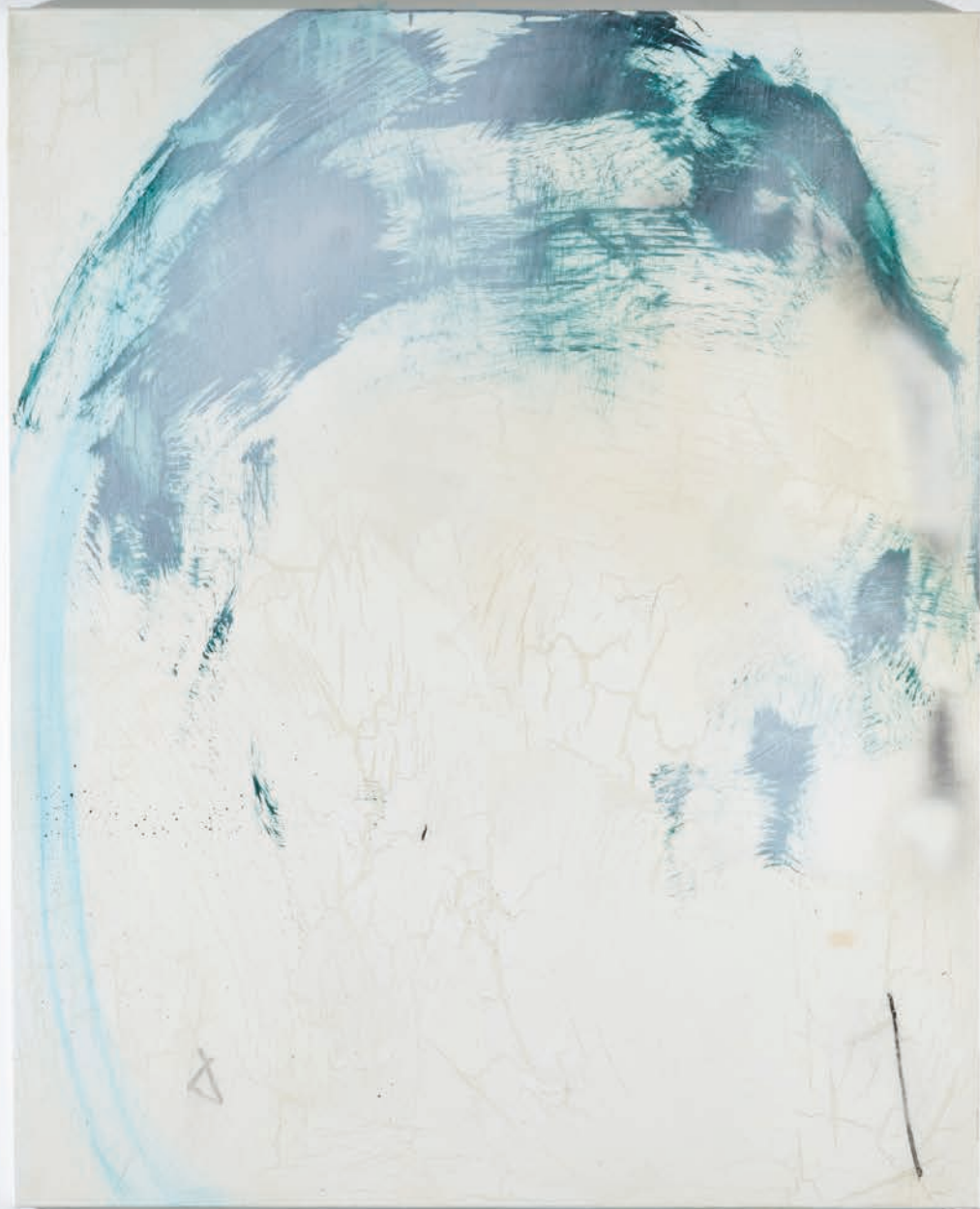
This way again mixed media on canvas 150cm x 120cm