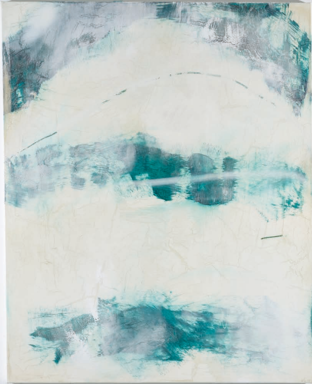
Now I know mixed media on canvas 150cm x 120cm