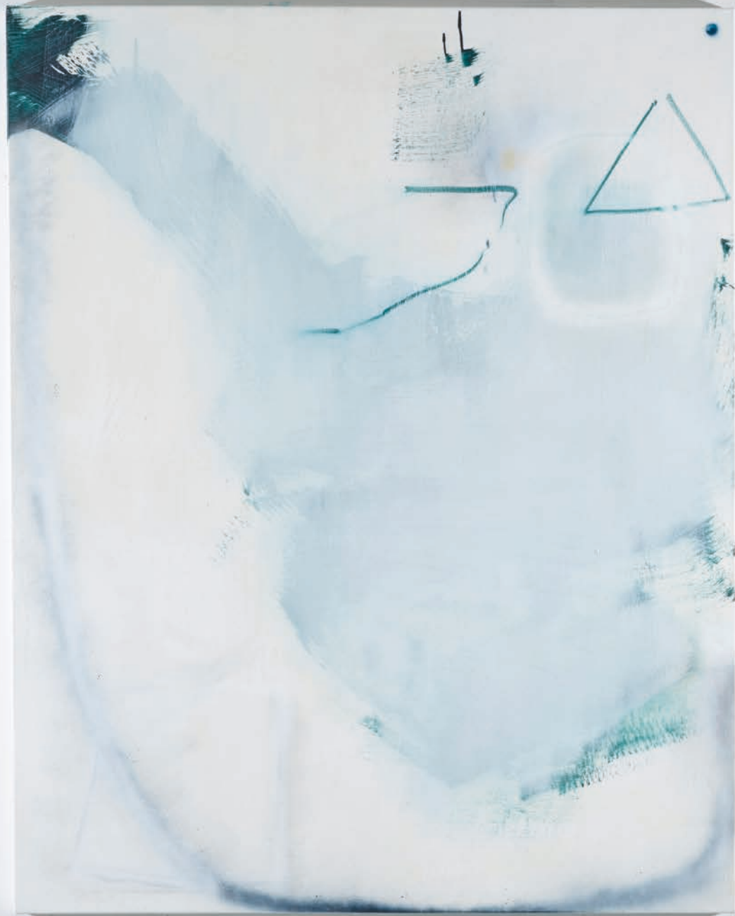
See through days mixed media on canvas 150cm x 120cm