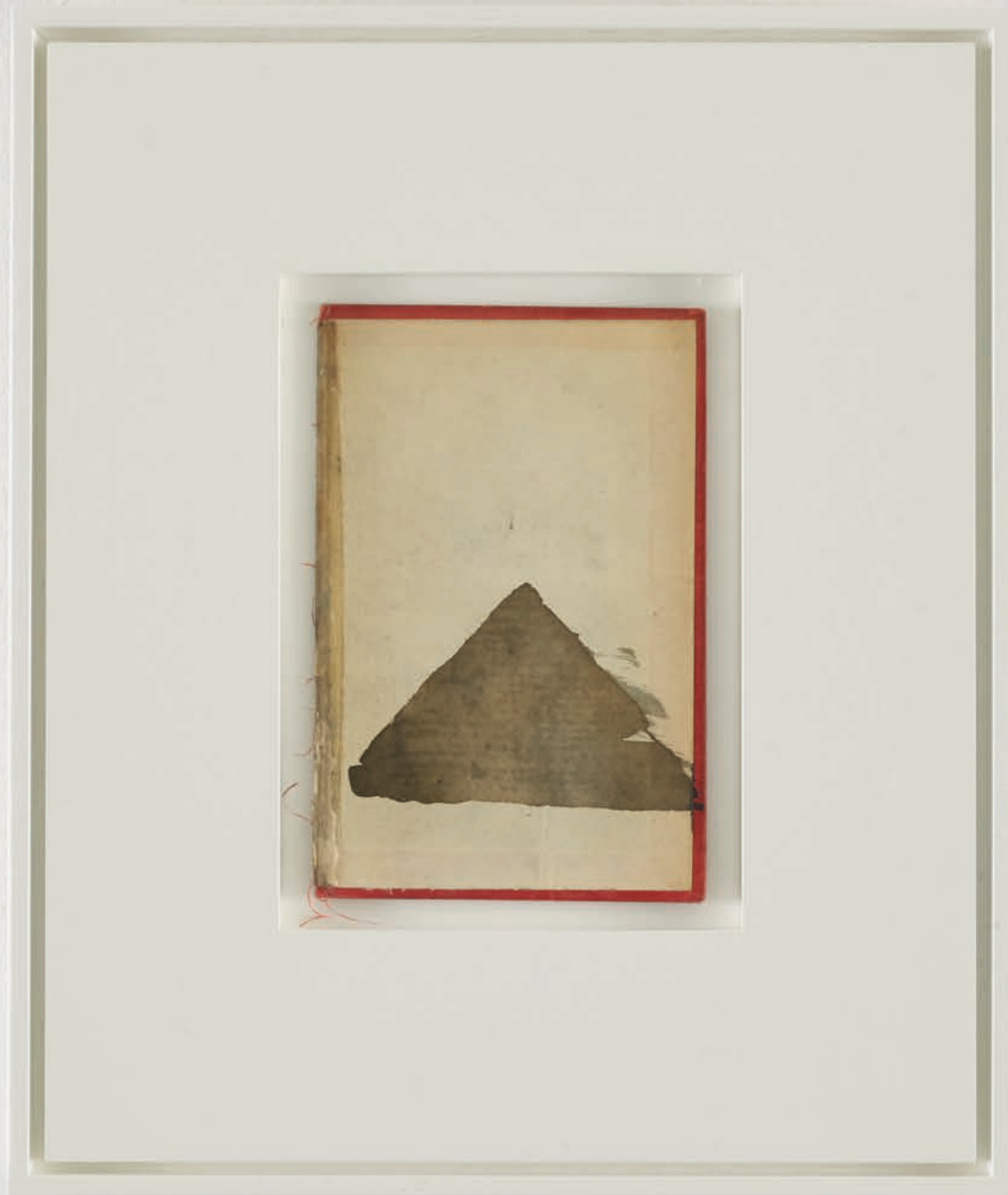
BOOK COVER (Peak)