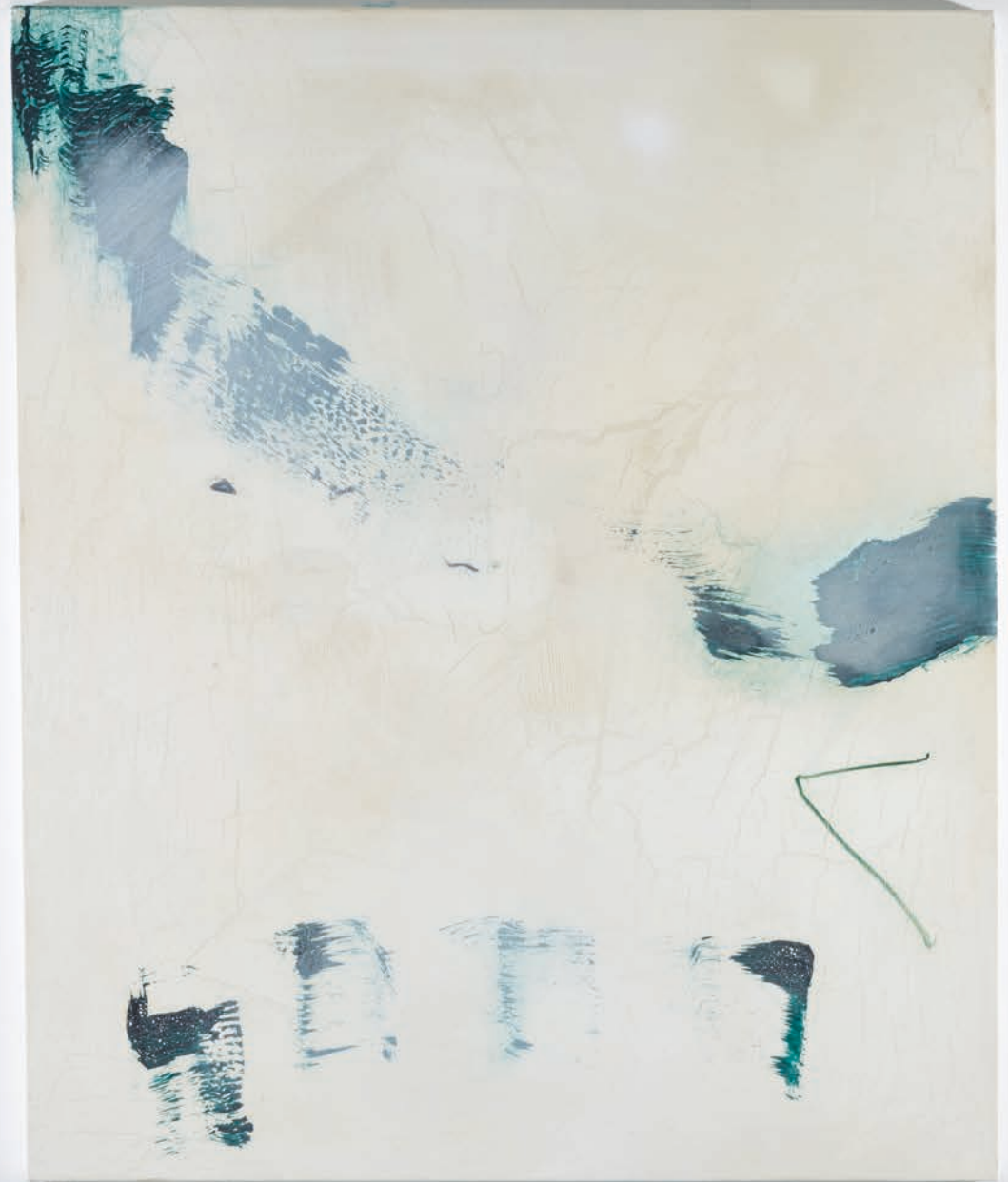
The centre breaks mixed media on canvas 150cm x 120cm