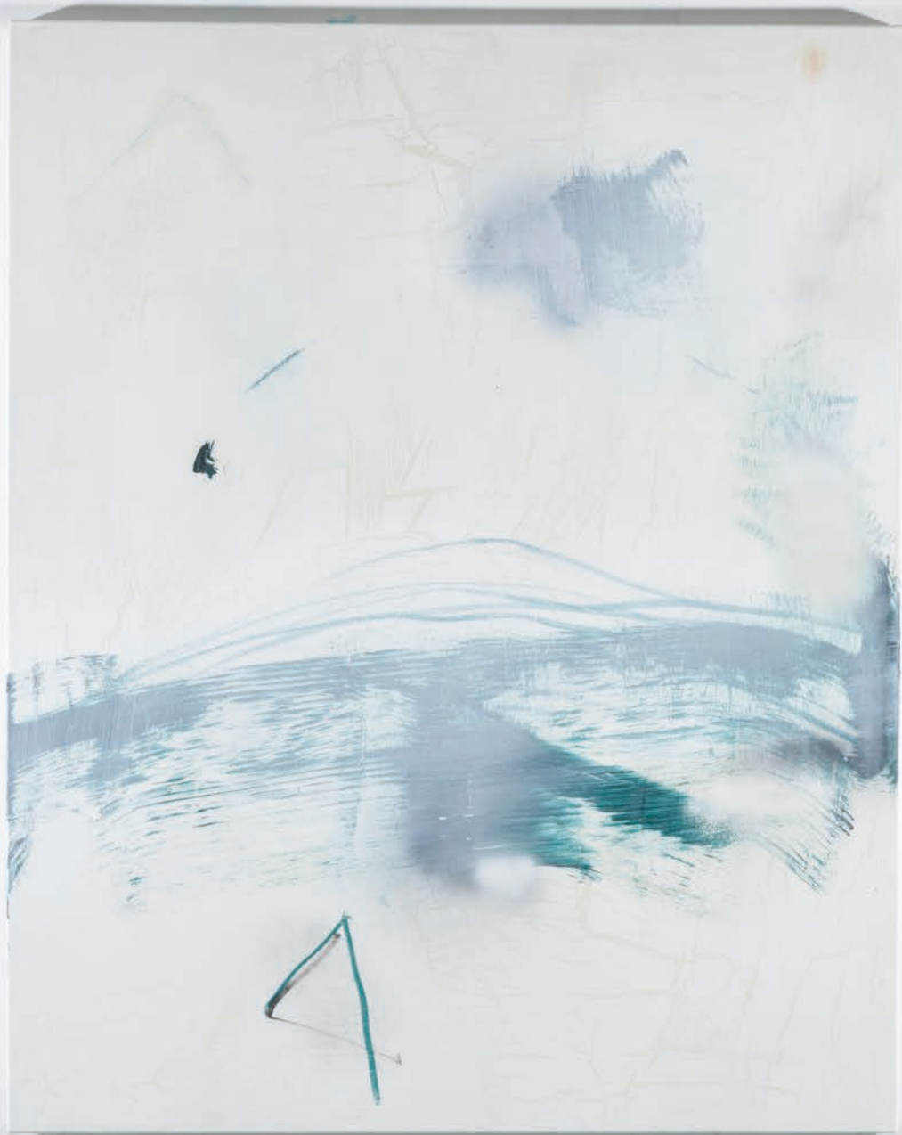
The horizon unseen mixed media on canvas 150cm x 120cm