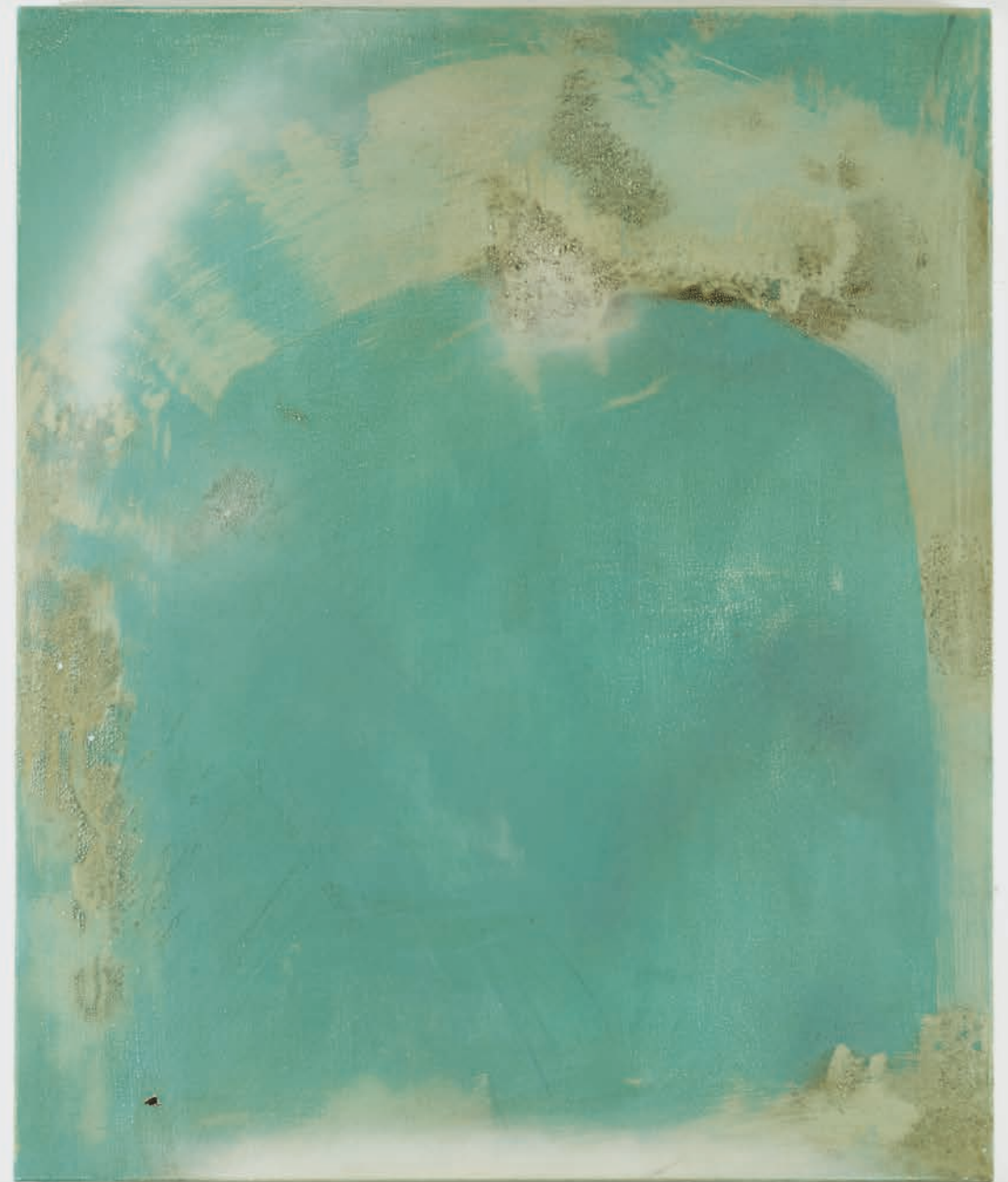
ABOUT YESTERDAY II