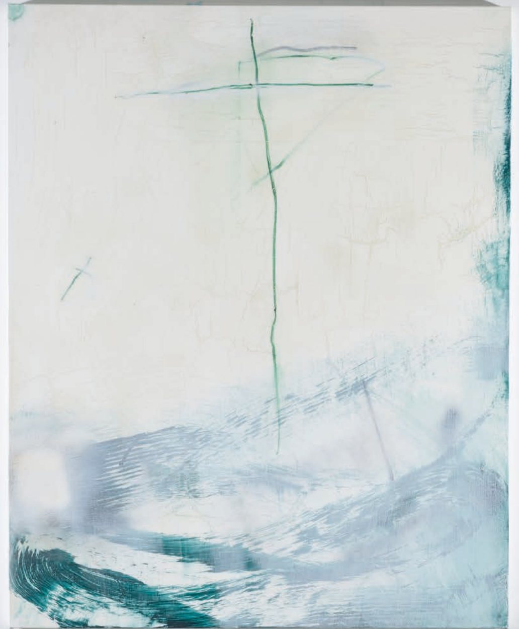
Before the mast mixed media on canvas 150cm x 120cm