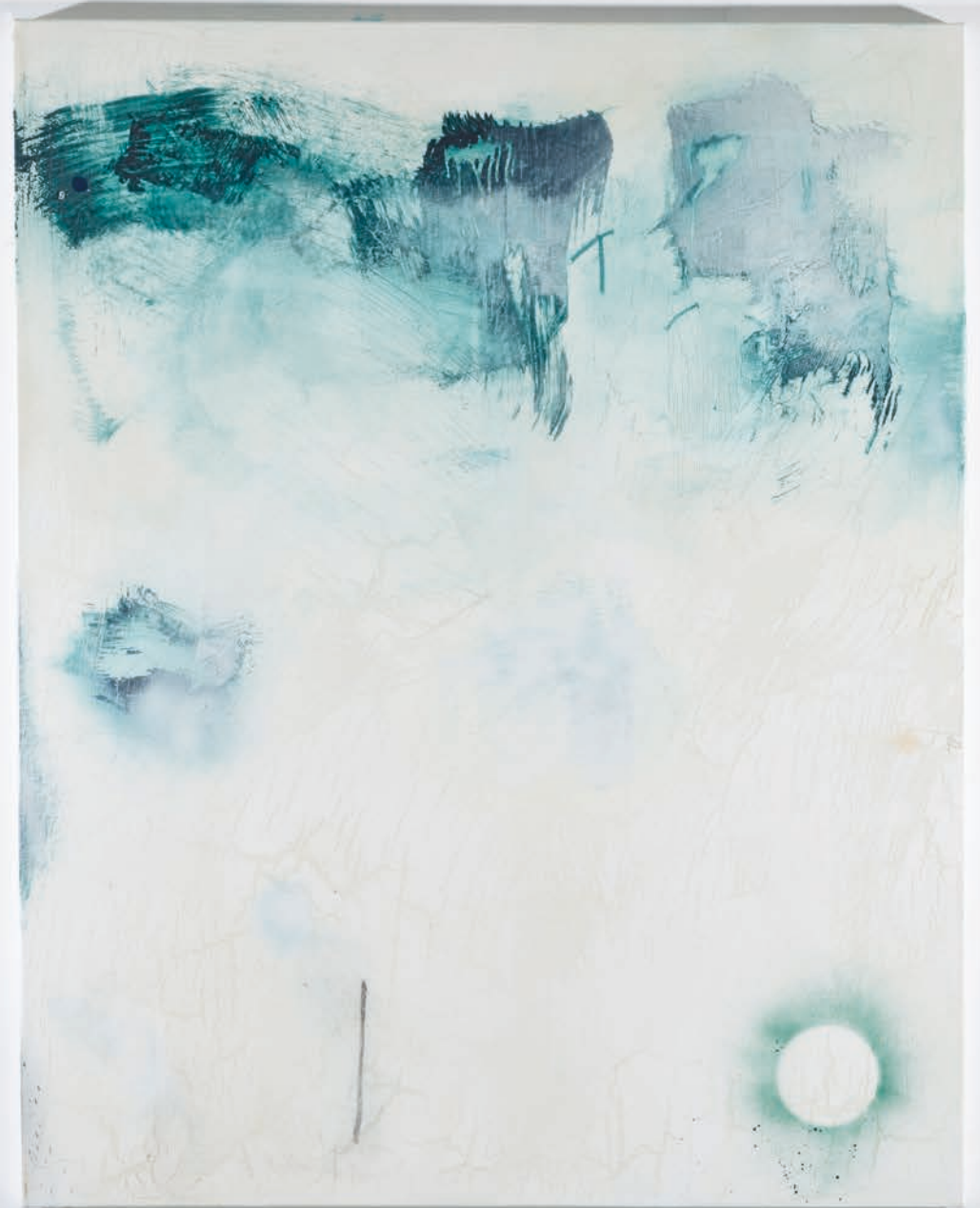
Roll away eclipse mixed media on canvas 150cm x 120cm