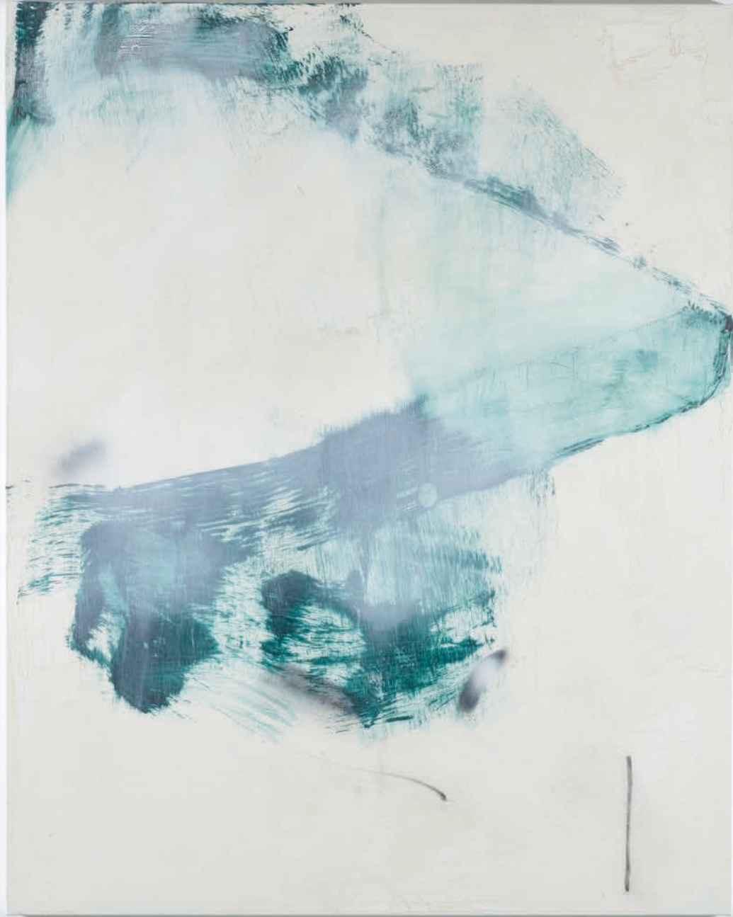
A corner unfound mixed media on canvas 150cm x 120cm