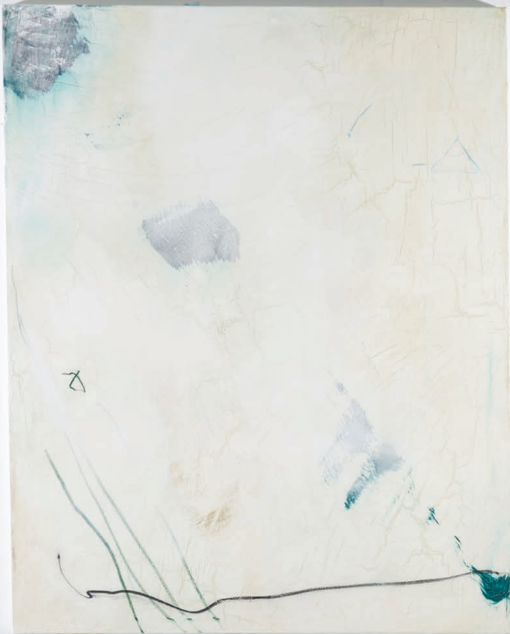
Where we walked mixed media on canvas 150cm x 120cm