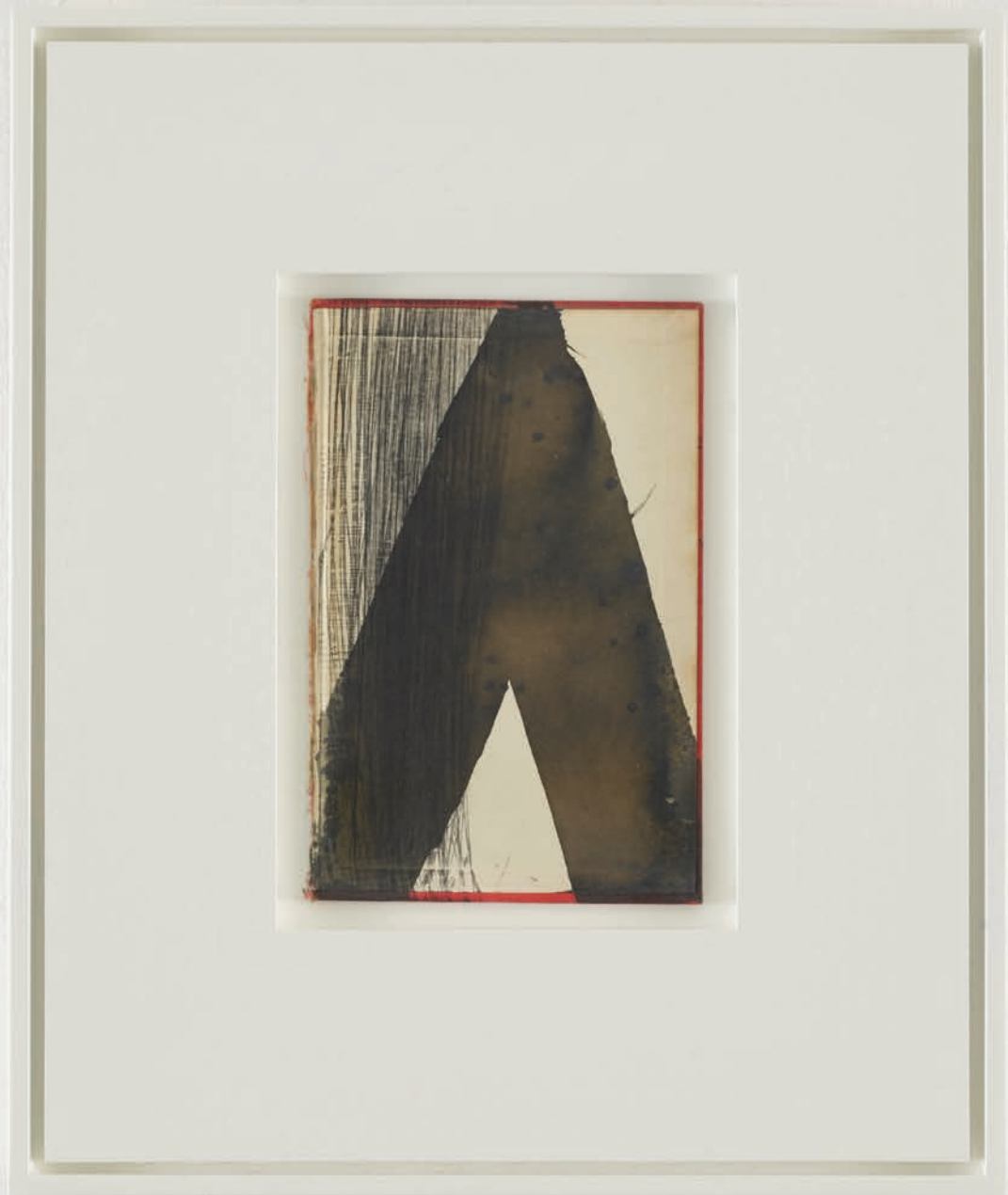
BOOK COVER (Steeple)